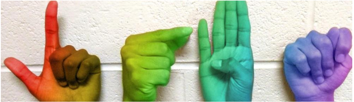
Figure 1D: Sign language spelling for LGBQ