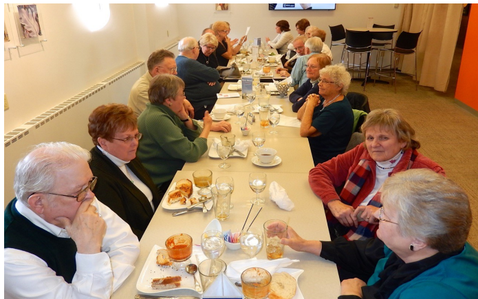
Lunch at the DAI