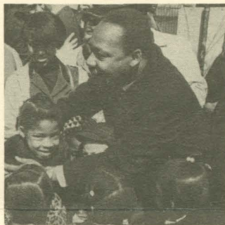
Dr. Martin Luther King, Jr.