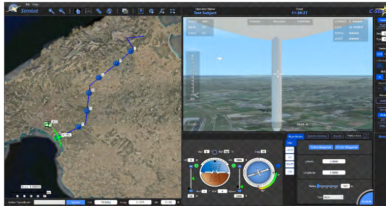
Figure 1. Trainee's Screen. Left side is showing the map screen with the route that the UAS will be following, while the right is showing the payload screen, with the zoom level indicator placed at the left edge of this screen.

field of view (FOV) measures on the map screen in the form of differently sized polygons. On the other hand, the sensor screen displayed the simulated model of the landscape of Mallorca, Spain. It had a crosshair located in the center and zoom level gauge located to the left, which were utilized by the operator to complete their missions.