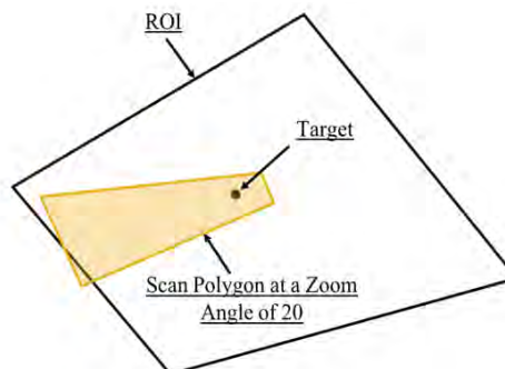
Figure 2. Target was classified as found if there existed a scan polygon (yellow) that happened below a zoom angle of 20 and the target was within the polygon.

Behavioral data processing. The Performance Analysis & Evaluation module (PANEL) of the C-STAR system outputted sub-area start time, time elapsed since the sub-area started, zoom angle at which the scan was being conducted, scan polygon vertices, region of interest (ROI) polygon vertices, target location within the ROI, and lastly true or false indicating whether a target fell within the camera FOV or not. Target found or NOT found was assessed by extracting all the polygons that happened at a zoom angle less than 20 and had "true" tag in the target in FOV column, an example of this is show in Figure 2.