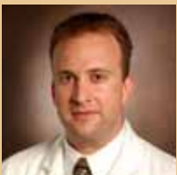
Mary C. McCarthy, M.D., Endowed Lectureship in Trauma Surgery