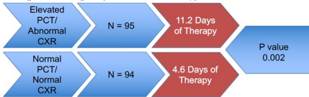
Figure 3. Average Days of Antibiotic Therapy based on PCT and CXR results

The length of hospital stay was not significantly changed during this time, 6.2 days in 2015 to 6 days in 2018 ( p = 0.766 ).