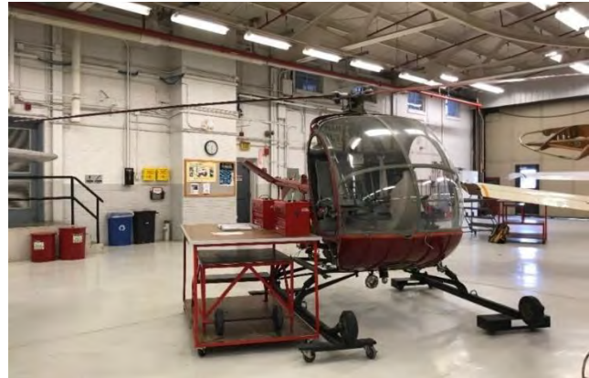
Figure 1. Schweizer 269A helicopter located at a Part 147 School

In order to fill the knowledge gap and increase student understanding of flight critical areas of helicopters, a laboratory project, also referred to as the laboratory activity, was designed around a Schweizer 269A helicopter, such as the one seen in figure 1. The course that this laboratory will be implemented in is a sophomore-level statics course with a bi-weekly, one-hour lecture and a weekly two-hour laboratory. The key concepts taught in the course are statics and forces on aircraft using the 3D modeling software CATIA to simulate the effects on various aircraft components.