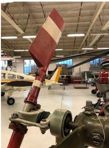
Figure 2. Schweizer 269A tail rotor used as a guide for the construction of the CATIA model

The main part of the project is a helicopter tail rotor, modeled with CATIA software after the Schweizer 269A tail rotor, shown in Figure 2. The finished CATIA modeled tail rotor, and tail rotor under analysis can be seen in Figure 3. In the laboratory activity, students will be simulating the forces felt by the tail rotor through normal operation by applying rotational forces on the CATIA model and observing the areas with greatest stress concentrations.