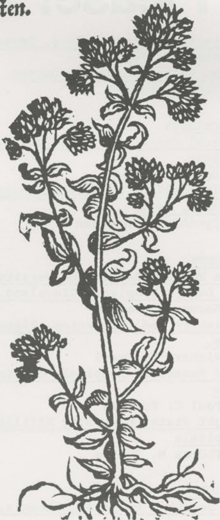
Oregano ( origanum vulgare , L.)

In folk medicine, Oregano leaves were chewed for toothache. The dried leaves, mixed with honey, were applied as a salve to bruises and contusions. Oregano tea was taken as a stomachic and for loss of appetite.