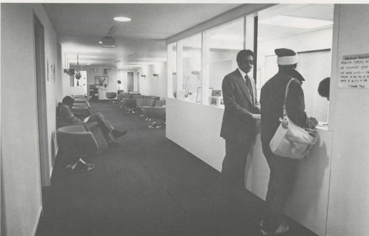
Shown above is the reception and waiting area at the Benjamin F. Lee Health Center.