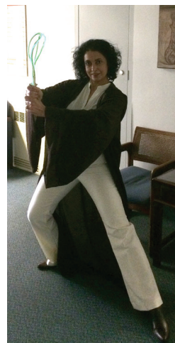
Ob-gyn Kenobi visits the Surgery Department for Halloween

I MAKE THESE PROMISES solemnly, freely, and upon my honor.