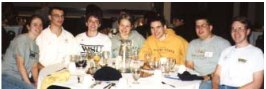
The WEC delegates pause for a picture during one of their meals at the NAESC Conference.