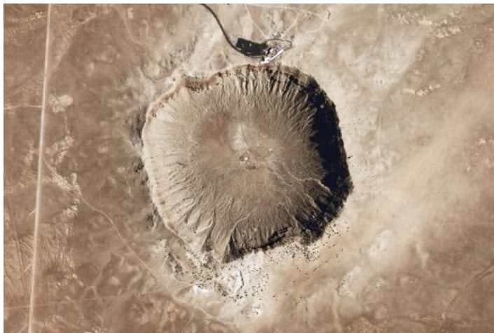
Figure 1: Satellite image of Barringer or Meteor Crater, Arizona U.S.A. The dark rectangle at the top is a museum. ( http://earthobservatory.nasa.gov/IOTD/view.php?id=39769 )

As terrible as these impacts were, none of them left craters. According to the Earth Impact Database (PASSC, 2015), there are almost 200 verified craters on Earth's surface from even bigger impacts, almost none of which occurred during recorded human history. Oddly, most of them were not identified as impact structures until the late 20 th century. Geologists generally attribute features like craters and canyons to events we can see taking place today or in recorded history, like erosion by rivers, gradual movement of rocks on either side of a fault by earthquakes over time, volcanic eruptions, etc. Craters