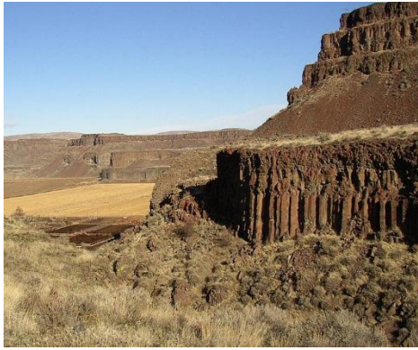
Figure 2: Three Devils Grade on the Columbia River Plateau.

One feature they share is that the minerals that make up continental flood basalts have an unusual