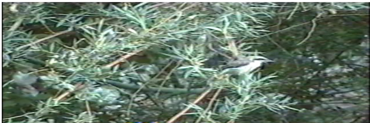
Fig 6: Southern Grey Shrike ( Lanius meridionalis )