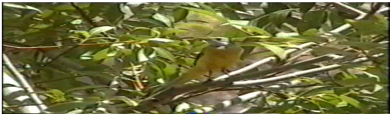
Fig 2: Citrine Wagtail ( Motacilla citreola )