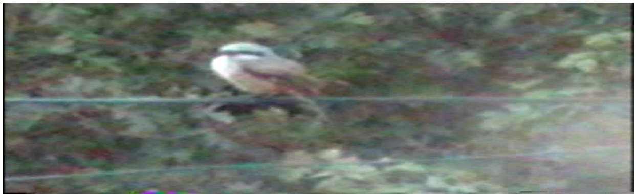
Fig 4: Long-tailed Shrike ( Lanius schach )