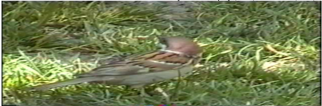
Fig 5: Russet Sparrow ( Passer rutilans )

Phoenicurus erythrogaster ( Guldenstadt Red Start ) has been noted and also reported by Ali and Ripley (1973) and Hasan (2001).