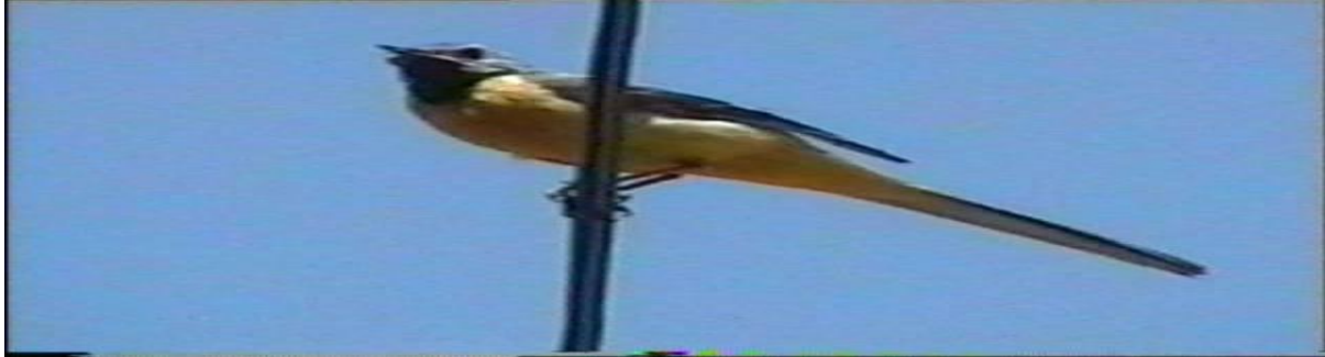
Fig 9: Yellow Wagtail ( Motacilla flava )