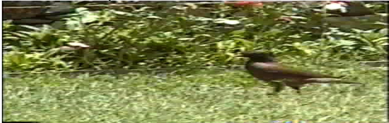
Fig 3: Common Myna ( Acridotheres tristis )

Bubo bubo ( Northern Eagle Owl ) has been confirmed as a resident bird of Chitral and also confirmed by Robert (1991), Ali (2001), Mirza (1998), Hasan (2001) and Grewal et al, (2002).