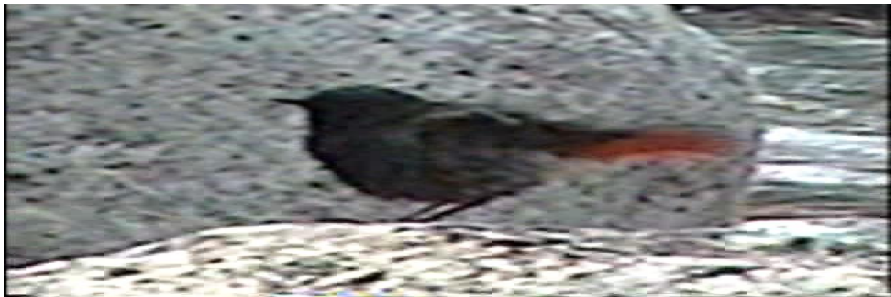
Fig 1: Black Redstart ( Phoenicurus ochruros )

Troglodytes troglodytes ( Wren ) has been found in the study area.