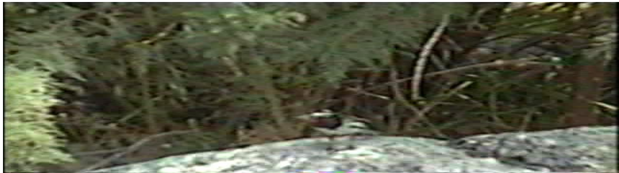
Fig 7: White Wagtail ( Motacilla alba )

Sturnus pagodarum ( Black headed Myna ) has been noted in lower part of Garm-Chashma in Chitral town and also reported by Roberts (1992).