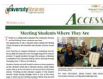
In our respective newsletters