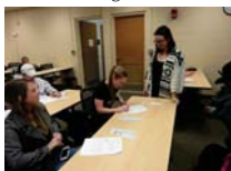
Integrating Your Sources Workshop - Co-taught with both areas