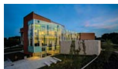
Option for joint presentations in classes