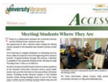
In our respective newsletters