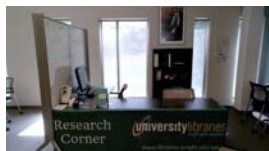
Library "Research Corner" in the Writing Center