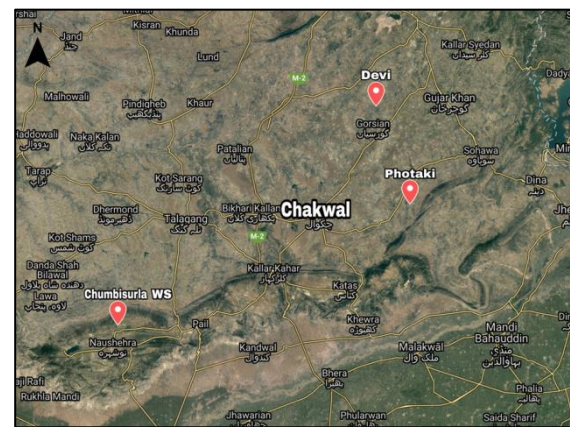
Figure 1: A satellite image showing location of the three selected study sites namely Devi, Photaki, Chumbisurla Wildlife Sanctuary (CWS) in District Chakwal, Pakistan.

Chakwal (32.9328° NL, 72.8630° E; Pothohar Plateau) is hilly country with reddish-brown soil. The environment is arid and cool, with sub humid climate. This area comprises of hilly undulates, with sandy patches (Chaudhry, et al., 2001). Almost 80% of human population lives in rural areas (Figure 1).