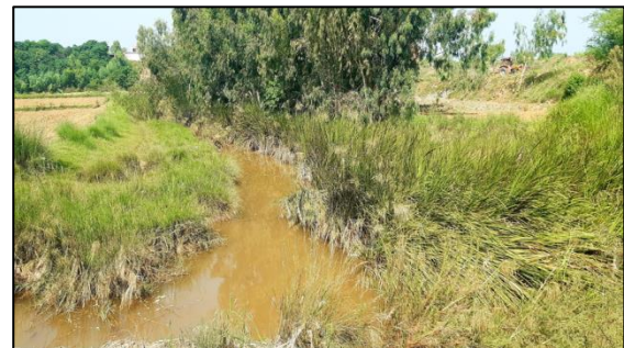
Figure 2: Habitat of red fox at Devi site. There were agricultural fields but undisturbed side-patches provided a red fox suitable habitat.

For habitat characterization samples of trees, shrubs and herbs species of both study sites were collected, identified and preserved on herbarium sheets as reference materials. For trees, shrubs and herbs species, data were recorded following quadrat-count Method (Haggett et al., 1965; Diggle, 2003). Quadrats were laid out randomly in each sampling site. For trees 10 m x10 m, for shrub species 4 m x 4 m and for herb species 1 m x 1 m quadrats were established to calculate density, frequency, cover and for calculation of importance value index (IVI).