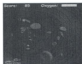
Figure 1: Screenshot showing the main display of the computer game including current score and status.

Coronary heart diseases (CHD) are one of the primary causes of deaths in the United States. It is commonly accepted that certain factors, such as a cholesterol high diet, increase the risk of coronary heart diseases. As a consequence, people should be educated to adhere a diet low in low-density lipoprotein (LDL or bad cholesterol). In order for children to become familiar with these facts, educational computer games can be employed to raise some awareness. This poster describes an educational museum exhibit that serves this purpose. In a game-like environment, children can practice their navigation skills, while learning about the various types of blood cells and particles within the blood stream. A geometric model of the arterial vascular system of the heart has been developed, which considers vessels of different sizes. An interactive fly-through using a standard game controller facilitates the exploration of the interior structure of the vasculature. A blood flow simulation including several different particles within the blood stream allows a player to explore their functionality. This computer game has been deployed as an interactive museum exhibit for children. The primary age group addressed by the science museum where it was displayed is 4-9 years. With proper guidance by the museum personnel and the instructional material provided at the exhibit the game is also suitable for slightly younger and much older children.