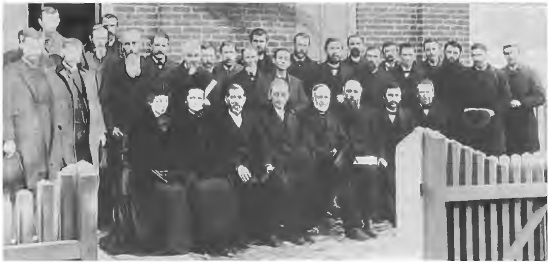
Photographs taken at the 20th General Conference of the Church of the United Brethren, held at York, Pennsylvania, May 9-19, 1889