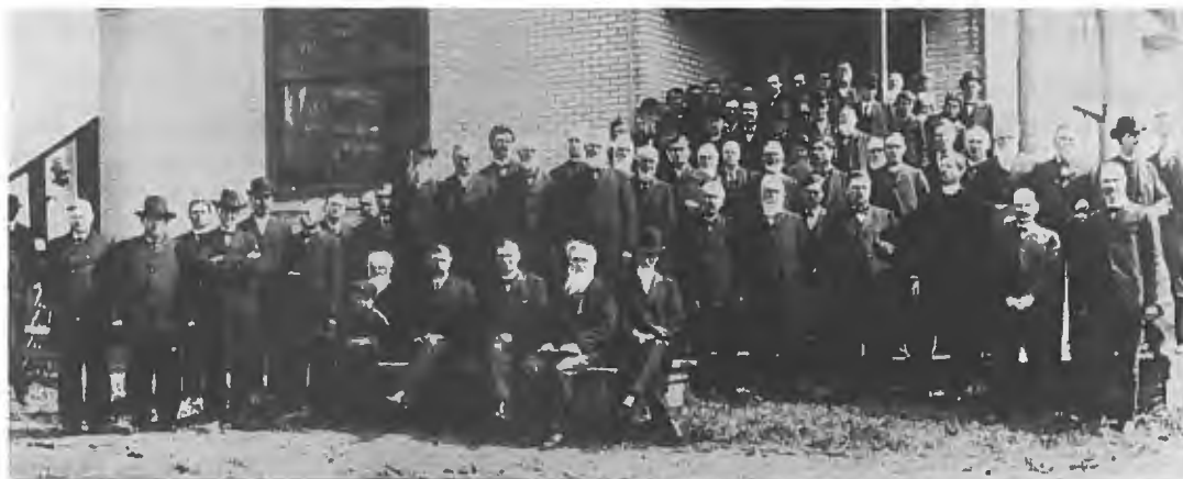
General Conference, 1905, in Caledonia, Michigan